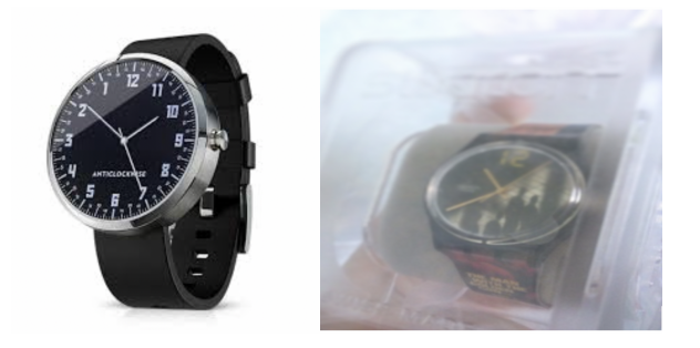
Figure 1: High vs Low demand products: the image quality plays a major role in gathering consumer interest in a product, and is a good predictor of demand.

ing to purchase the product. A number of factors contribute towards predicting demand of items in ecommerce marketplaces. While aspects like region, city, price and product category are direct indicators, often the quality of product description and images describing the product play a major role in garnering consumer interest in the product. Our goal is to jointly model such varied information in predicting demand.